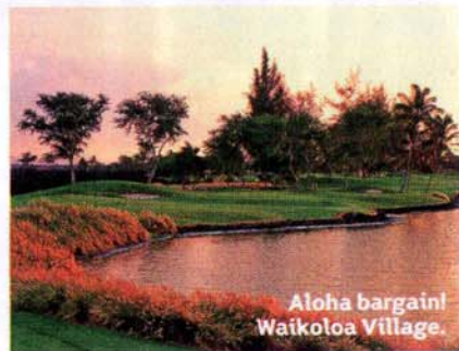
Aloha bargain! Waikoloa Village.